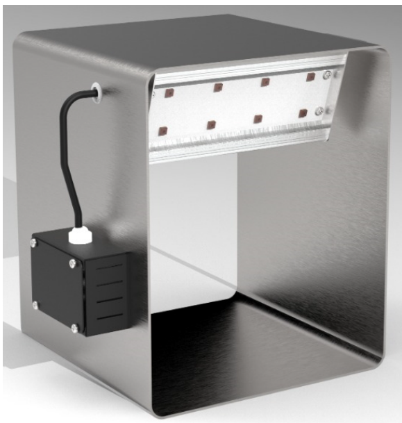
10" x 12" duct size

Our HM-UVC280IN light provides significant radiant energy to break the carbon bonds of viruses, incapacitating their RNA and DNA strands so that they can no longer replicate and become eradicated.