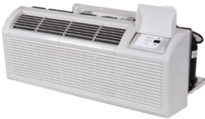
42" PTAC SHOWN ABOVE